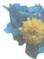
A Tidskrift om ad

förskola och extraskola för 460 barn i åldrarna 2-15 år. Prayas har center i flera utsatta områden i staden. Det är inte alltid man som här, i Kathaputhi Colony, ett område med ca