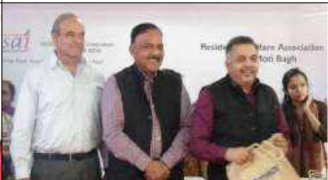
Prayas, the FSSAI and Central Governments Employees RWA jointly organized a training program for Domestic workers