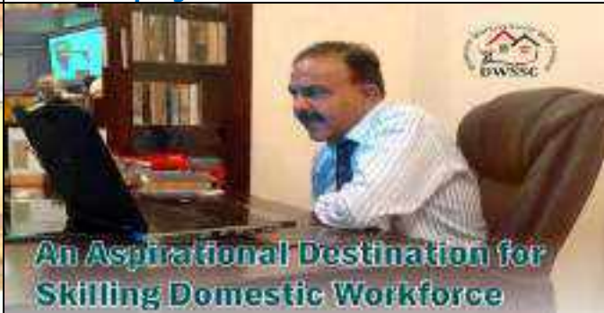
Lt. Governor of Delhi Mr. Anil Baijal praises the work of Prayas