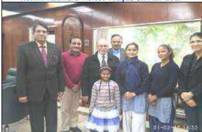
Lt. Governor of Delhi Mr. Anil Baijal praises the work of Prayas