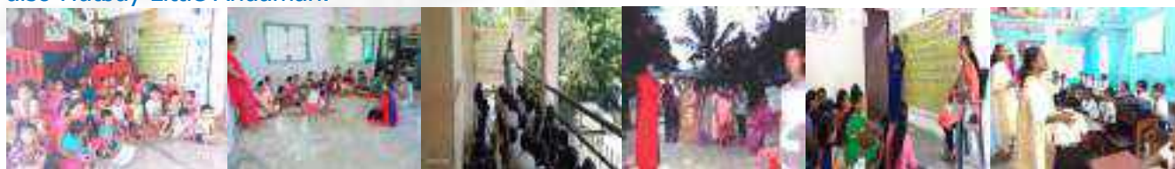
Snapshots--Anganwadi Meeting, Awareness Programme at School & Community Meeting Conducted at Little Andaman, Hutbay

CHILDLINE team has conducted around 6853 Nos. person hours of outreach and awareness programme from April 2019 to March 2020. Almost, covered all the Municipal areas of Port Blair and also Hutbay Little Andaman.