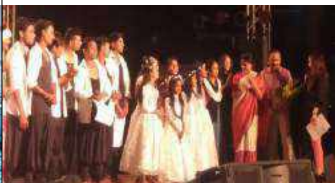
Prayas leaves a mark at Youth Festival