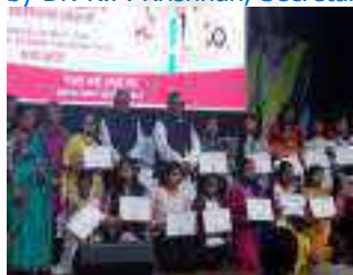
International Women's day Celebration at Ambedkar International Center