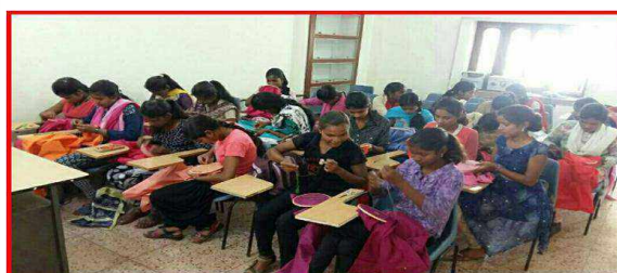
Tailoring & Embroidery