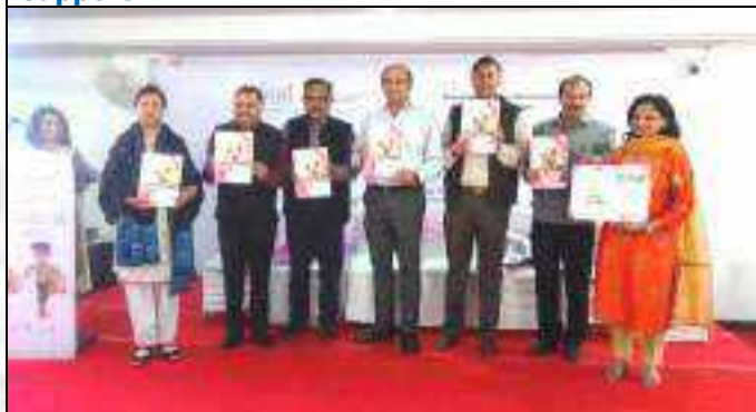
Prayas, the FSSAI and Central Governments Employees RWA jointly organized a training program for Domestic workers