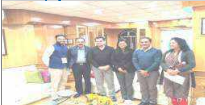
Prayas meets NITI Ayog CEO Amitabh Kant