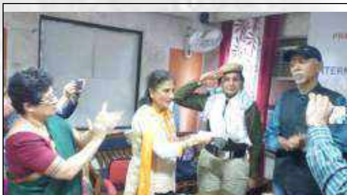
Brave Prayas team rescues girls without police support