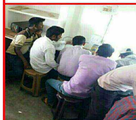
Hardware & Networking